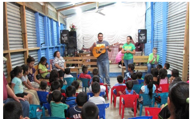
VBS at Mision Restauracion in the Garbage Dump area of Guatemala City

The two churches sent the first team in July, 2015. We had planned, prayed, collected materials, met with the missionaries via Skype, and felt much excitement as we began our journey. Our ministry was in Guatemala City, in Zone 3, the Garbage Dump. Cristo es el Camino has various ministry points, and one of the missions is Mision Restauracion, located in the Garbage Dump area of the city. Many of the families who live in this area live in small, one or two room houses, made of tin, with concrete or dirt floors. The adults work in “recycling”, which means they may go into the dump area to find recyclable materials. It is demeaning work, often dangerous. The people who do this work live day-to-day, and there are many obstacles in their lives: alcoholism, single-parents/absentee fathers, extreme poverty, health concerns, lack of education. While it can be discouraging to see these obstacles, it was a clear blessing to us to see the way God is at work in this area and the joy of the Lord is evident in the lives of the members and believers.